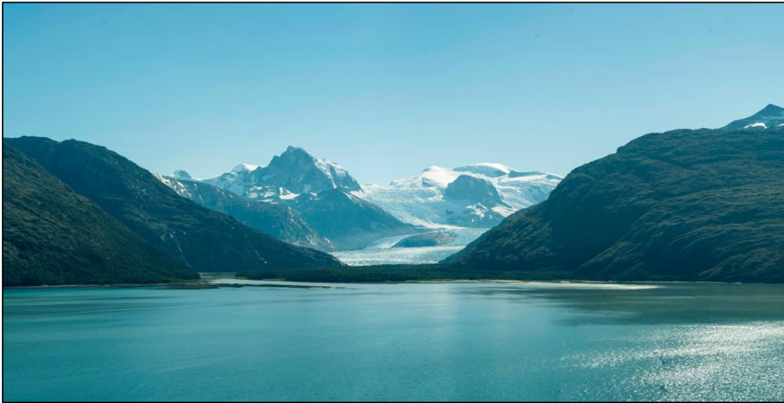
Chart a course through the labyrinthine fjords that define Chile's spectacular coastline on this 2-week expedition cruise, sailing from Cape Horn to Valparaiso with numerous stops enroute to fully explore this magnificent coastline.

The Chilean Fjords are one of nature's great wonders – a complex maze of inland passages, fjords and glaciers, which sustain a thriving coastal wildlife including large colonies of penguins, elephant seals, cormorants, steamer ducks, and migrating whales.